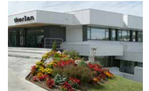
> NEWS AND UPDATES ULMA Architectural Solutions refurbishes the façades of 2 emblematic buildings of Arrasate: Torre Eguzki and Ikerlan