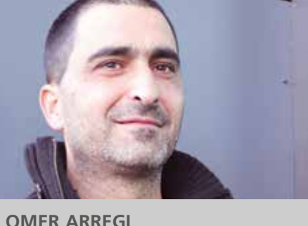
Hardware Development Engineer

"From 10 years ago to now we have learned a lot at ULMA Embedded Solutions. We have witnessed the establishing of a company with our own eyes. We have had to work in different areas, which has required a lot of dedication and hard work: the implementation and management of the project, conducting sales, creating the quality system, launching the Euskera Plan... All of this has allowed us to develop personally and we hope that this development will continue for many more years alongside ULMA Embedded Solutions".