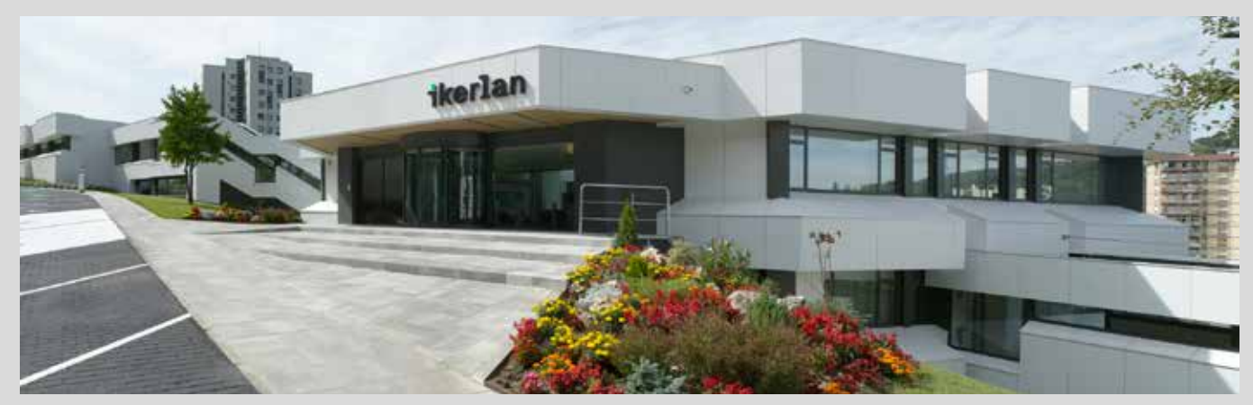
Cooperation between cooperatives took place on both projects between: LKS KREAN, a leading company in the engineering and architectural sector, IKERLAN and ULMA Architectural Solutions. The three cooperatives of the MONDRAGON Group have collaborated closely for the purpose of refurbishing these emblematic buildings of this Guipuzcoan municipality.

Technical solutions tailored to the complex shapes of the building have been applied. 6,220m<sup>2</sup> of facade have been covered integrating a polymer concrete ventilated facade with heat and noise insulation, which has improved the energy classification of the building.